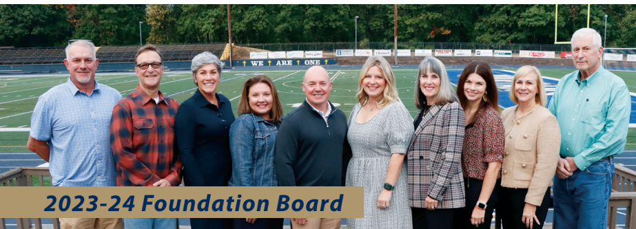
2023-24 Foundation Board

The Marist Foundation was created in 1968 and is dedicated to providing Marist Catholic High School and its students with funds exclusively for educational and religious purposes, including tuition assistance and other education expenses for students qualifying for financial assistance.