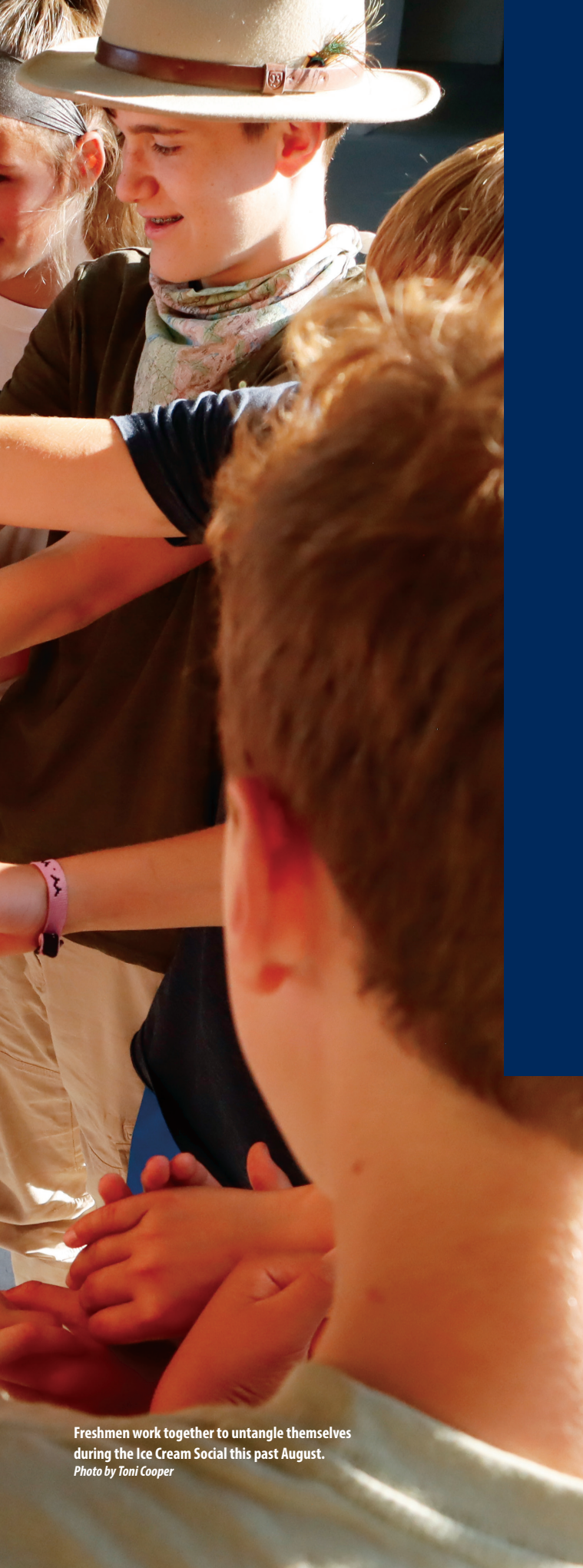
Freshmen work together to untangle themselves during the Ice Cream Social this past August.