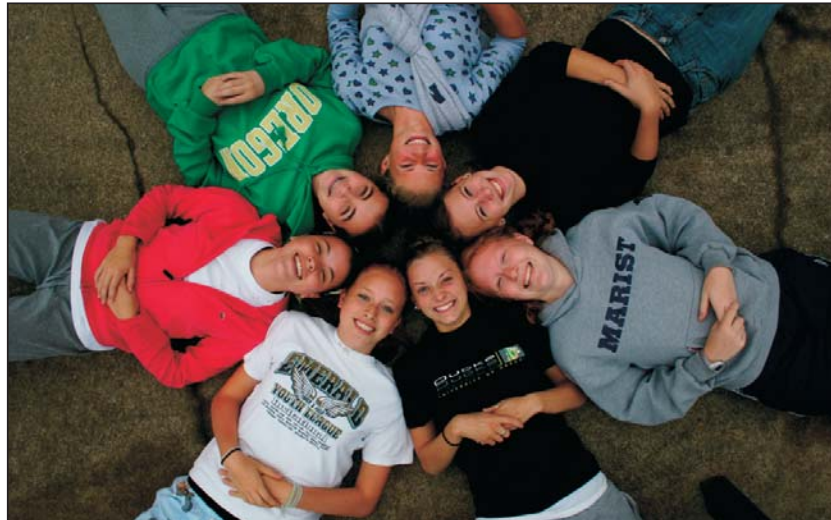
Several sophomore girls pose for a small group picture at the Sophomore Girls Retreat last weekend.