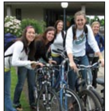
A group of seniors help out the environment by biking to school.