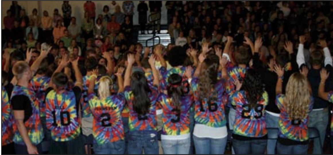
Seniors give their final blessing to student body and staff.

Seniors say goodbye to high school at annual Farewell Mass